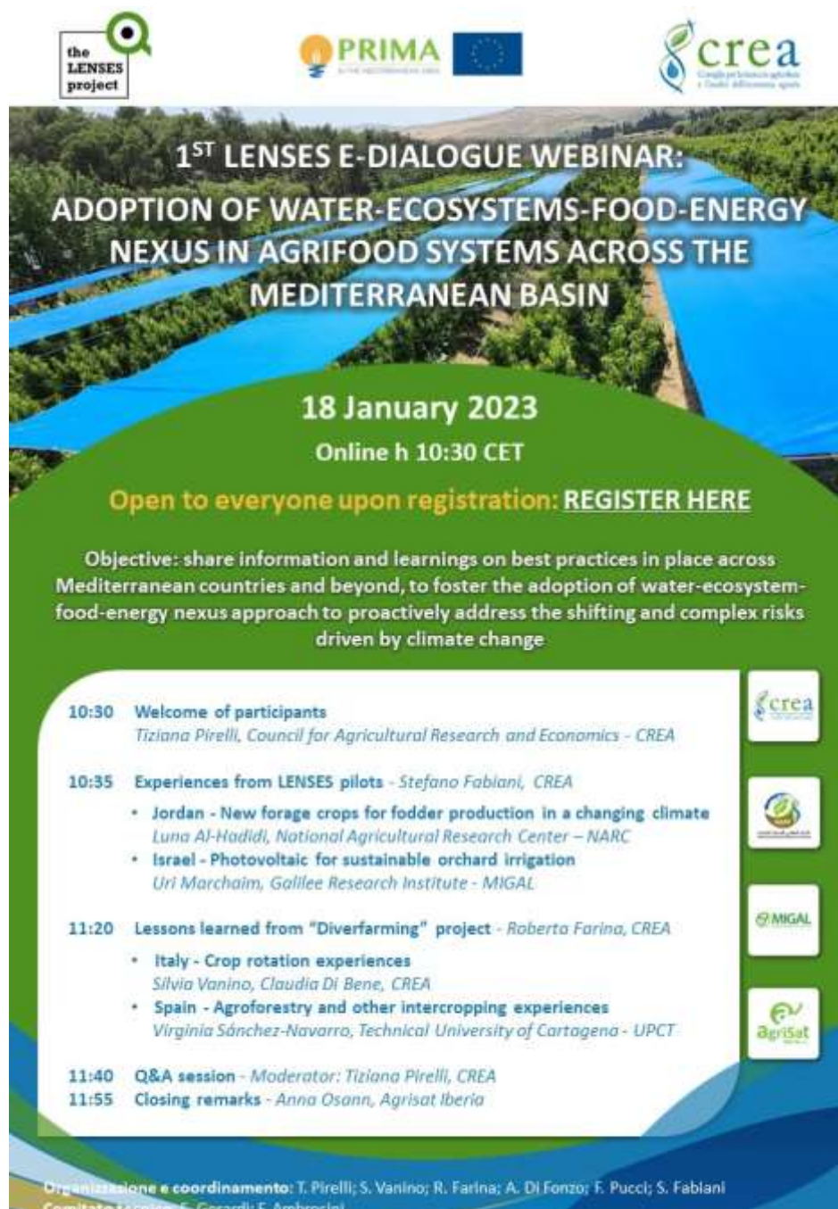
Figure 1 – Agenda of the 1 st LENSES e-dialogue webinar to be held on 18 January 2023